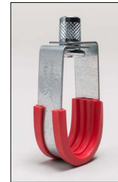
(intended use of channel liner)